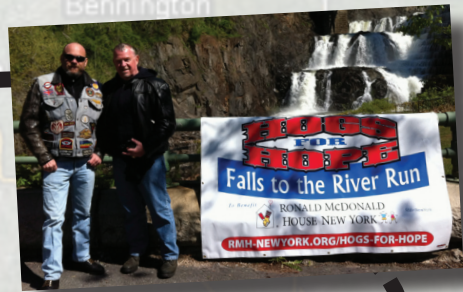
Participation in charity events are part of our community services.