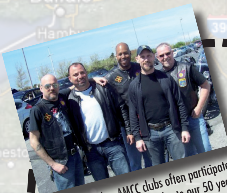
Members of other AMCC clubs often participate in our festivities. We will celebrate our 50 years of brotherhood, comraderie and riding in 2014.