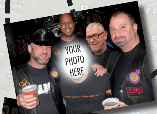
Come find yourself in the middle of the action. During off-riding season, we have bar nights following our monthly club meetings.