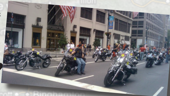
Get exclusive access to participate in New York's annual LGBT Pride Parade. Traditionally, ECMC leads the male bikers.