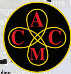
Established in 1964, ECMC is a founding member of Atlantic Motorcycle Motor Club (AMCC).